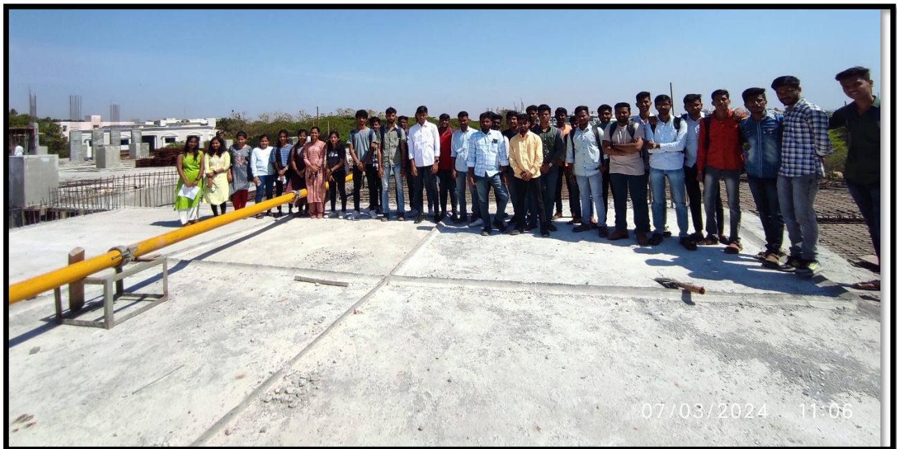
Fig.4: students at AI COE building construction site