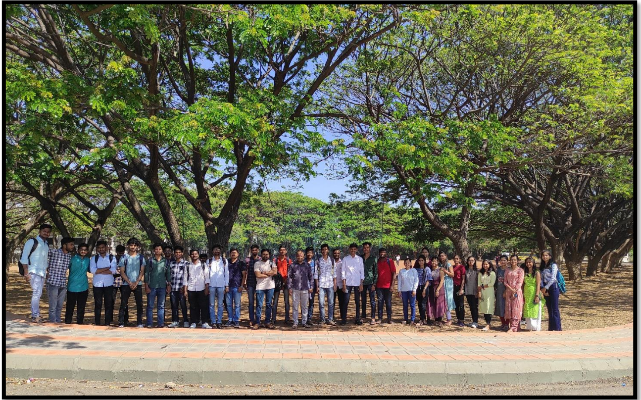
Fig 1: students in Campus near Boys hostel and CBSE school, Playground