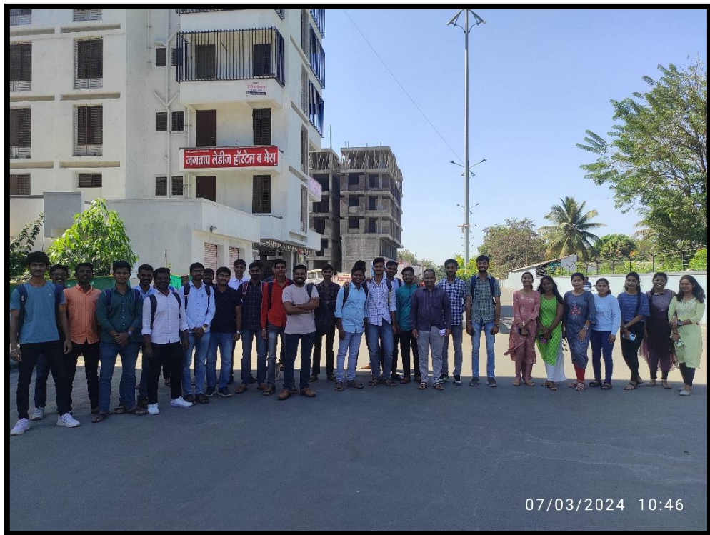
Fig. 2: students at widening / construction of roads as per proposals in DP of Baramati